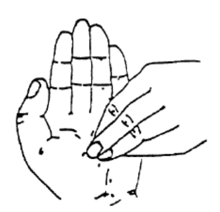
Rotational rubbing, backwards and forwards, with clasped fingers of right hand in left palm and vice versa