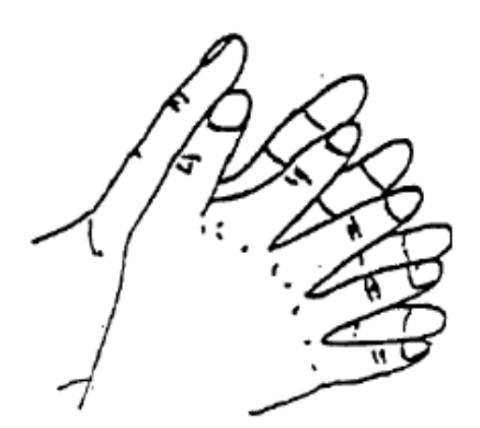
Palm to palm fingers interfaced